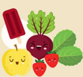
STRAWBERRY, BEET, SPINACH, APPLE JUICE