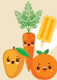
MANGO, ORANGE JUICE, CARROT JUICE