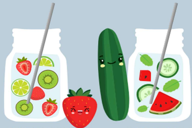
STRAWBERRY + KIWI + LIME