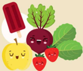
STRAWBERRY, BEET, SPINACH, APPLE JUICE