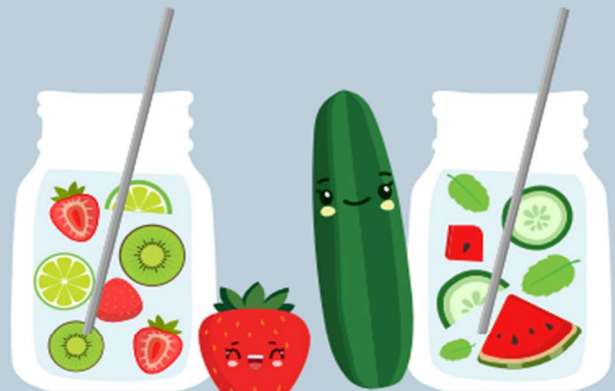
STRAWBERRY + KIWI + LIME