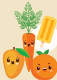
MANGO, ORANGE JUICE, CARROT JUICE