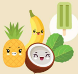
PINEAPPLE, BANANA, COCONUT MILK, SPINACH

*DO NOT attempt to chop or blend without adult supervision.