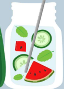
WATERMELON + CUCUMBER + MINT