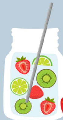
STRAWBERRY + KIWI + LIME